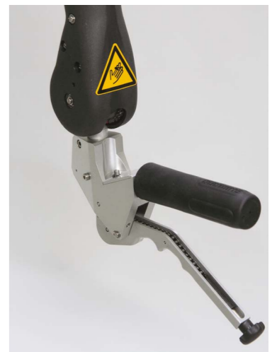
Wrist + Handle