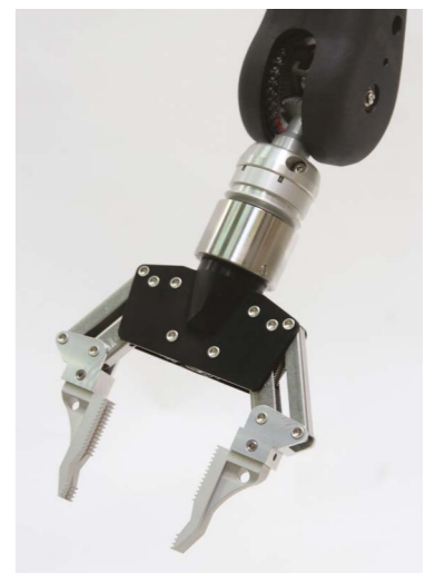
PEM 78 Jaws