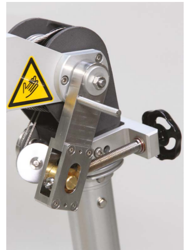
MA 30 Elbow