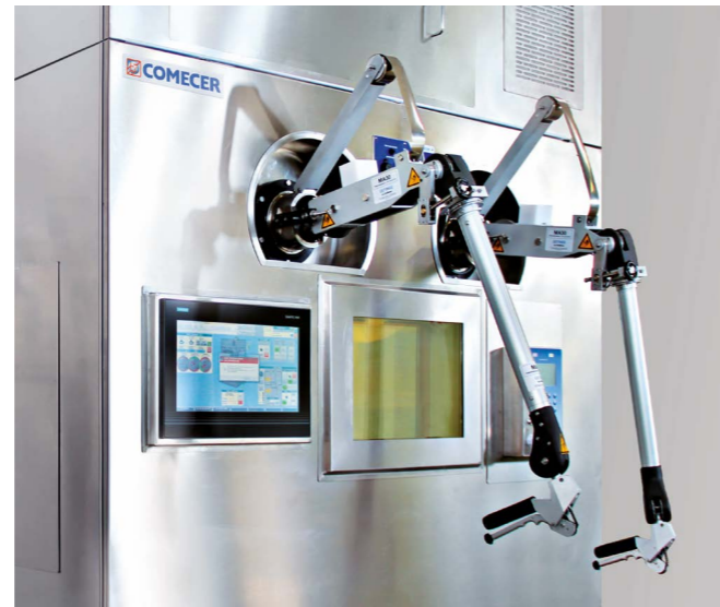
MA 30 manipulators installed on shielded cells (radiopharmacy applications)